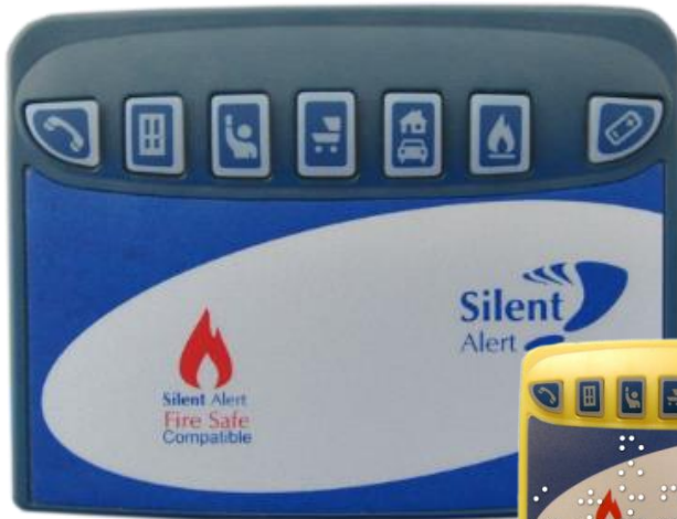
Blue Pager actual size when printed on A4